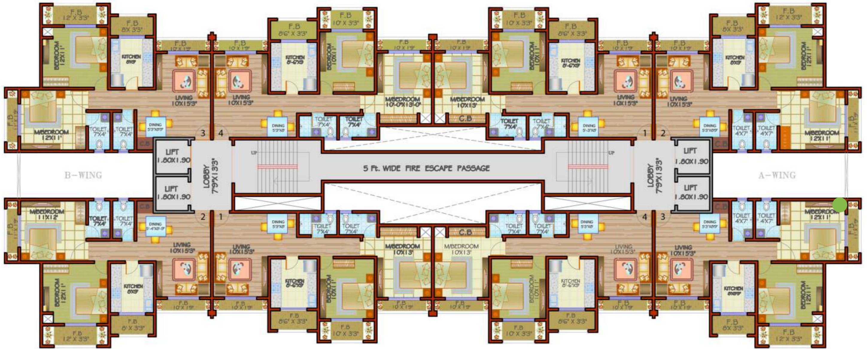
SALE PLAN (E-1)